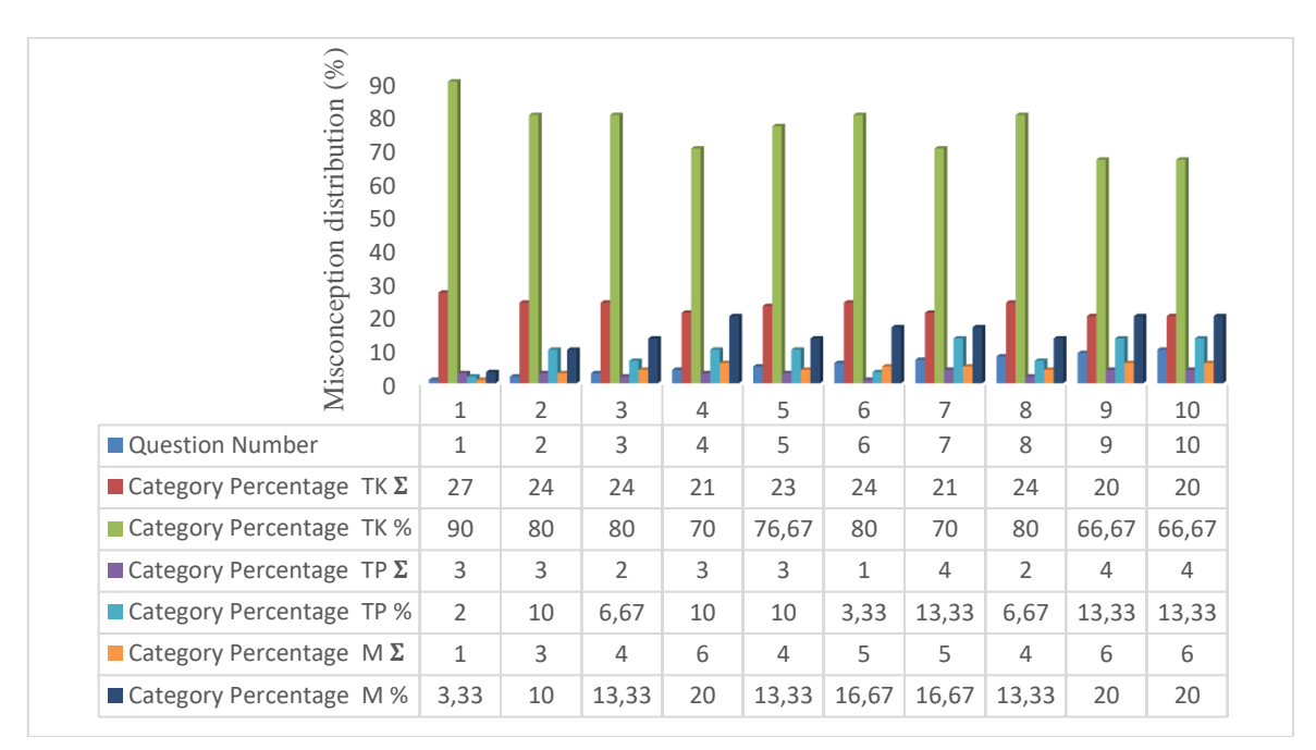
Figure 2. Histogram of the level of misconception of all students in each Question Point after PBL implementation

The Effect of Problem-Based Learning in Reducing the Misconceptions of Junior High School Learners on the Material of Substance Pressure